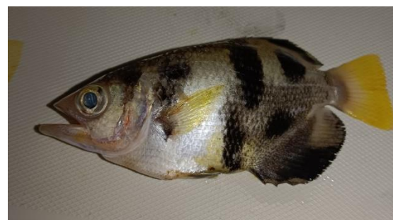
Figure 2: Archer fish Toxotes jaculatrix .